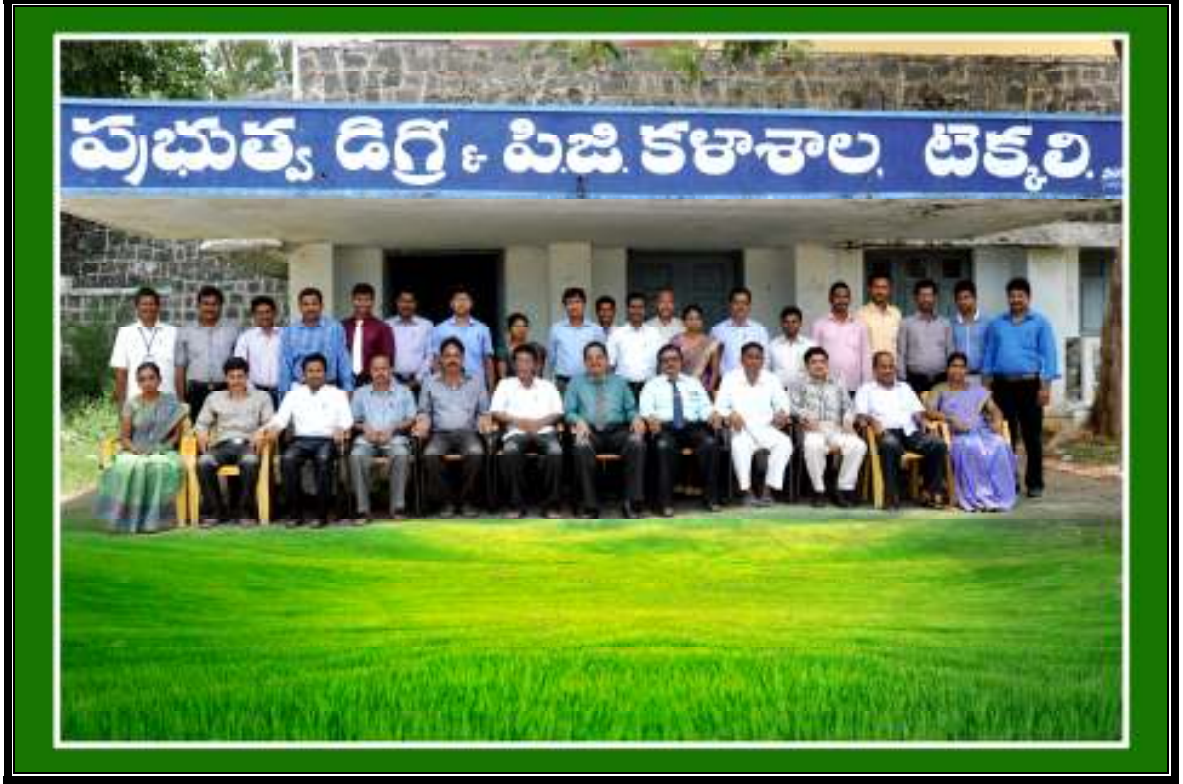
Principal, Teaching and Non-Teaching Staff